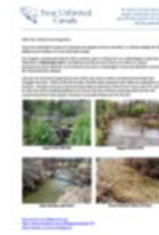
Email Distribution List - middlegrandchapter.tuc@gmail.com